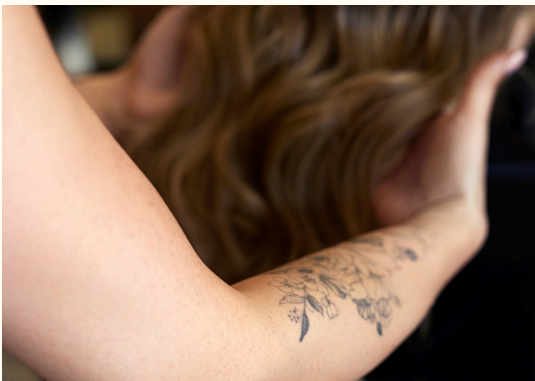
Bridal Party Makeup & Styling