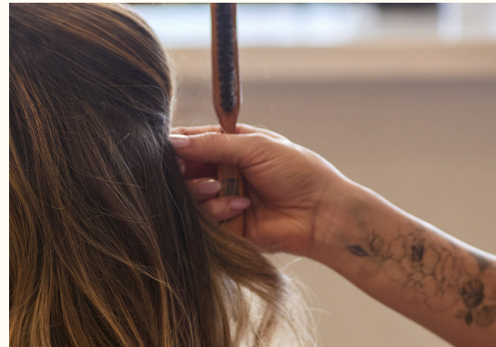
Engagement Photo Makeup & Styling